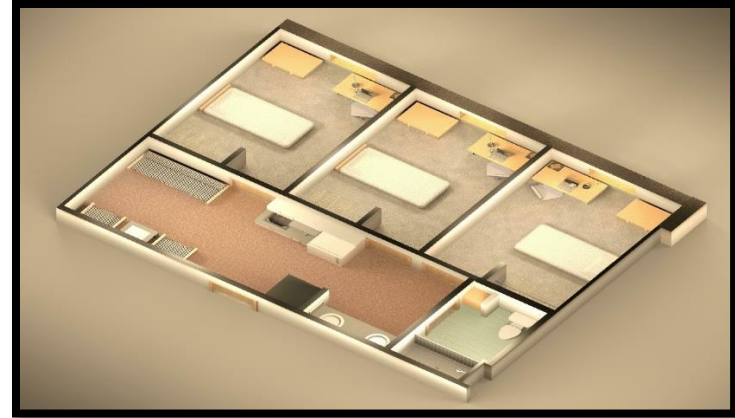
3 bedroom single (Osprey & Eagle Hall) $3180